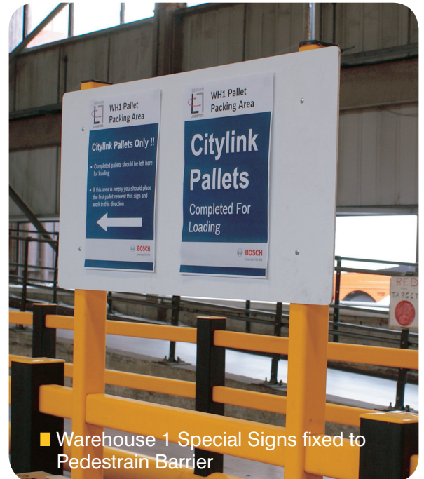
■ Warehouse 1 Special Signs fixed to Pedestrian Barrier

Unlike steel, which simply dents or crumples when a vehicle hits it, an A-Safe barrier has inherent strength and structural memory allowing them to buckle on collision, dissipating impact forces and