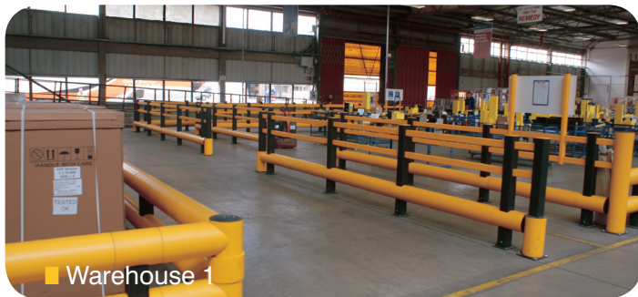
■ Warehouse 1