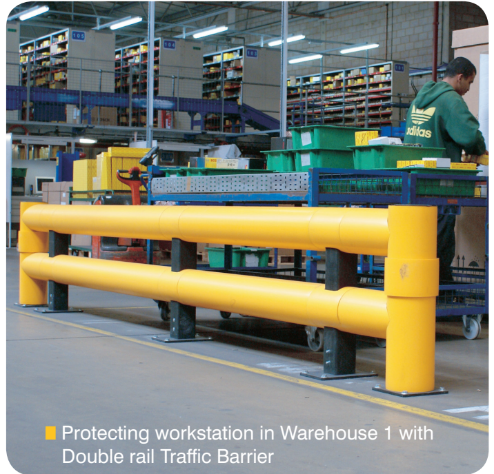
■ Protecting workstation in Warehouse 1 with Double rail Traffic Barrier

It is with pride that A-Safe, the safety barrier specialists based in Halifax, England, has been identified and chosen to enhance Bosch's impressive safety record in caring and protecting their staff in the warehouses at the UK head office based in Denham, Buckinghamshire, home to the Power Tools