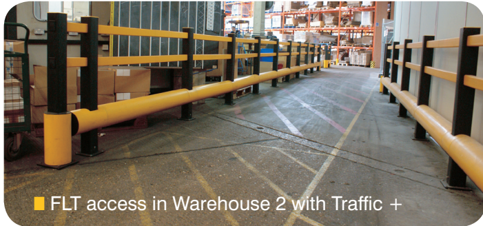
■ FLT access in Warehouse 2 with Traffic +

In 2011, Bosch celebrates 125 years, during which time the Bosch Group has become a leading global supplier of technologies and services across automotive and industrial technology, consumer goods and building technology. With its history of innovation, driven by research and development, Bosch has remained at the forefront of new technologies designed to improve customers' lives. Founded in Stuttgart, Germany by Robert Bosch as a "workshop for precision mechanics and electrical engineering", the first overseas subsidiary was opened in the UK in 1898, just off Oxford Street in London.